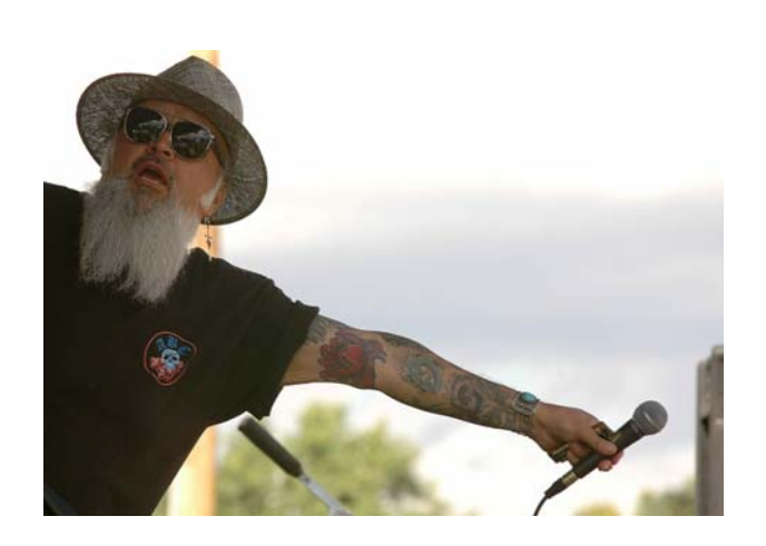
Los Albuquerque Blues Connection